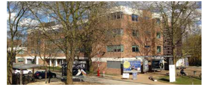
Our campus at City of Oxford College

At break times students have access to the café, Wi-Fi, and lovely seating areas on the grass beside the mill stream.